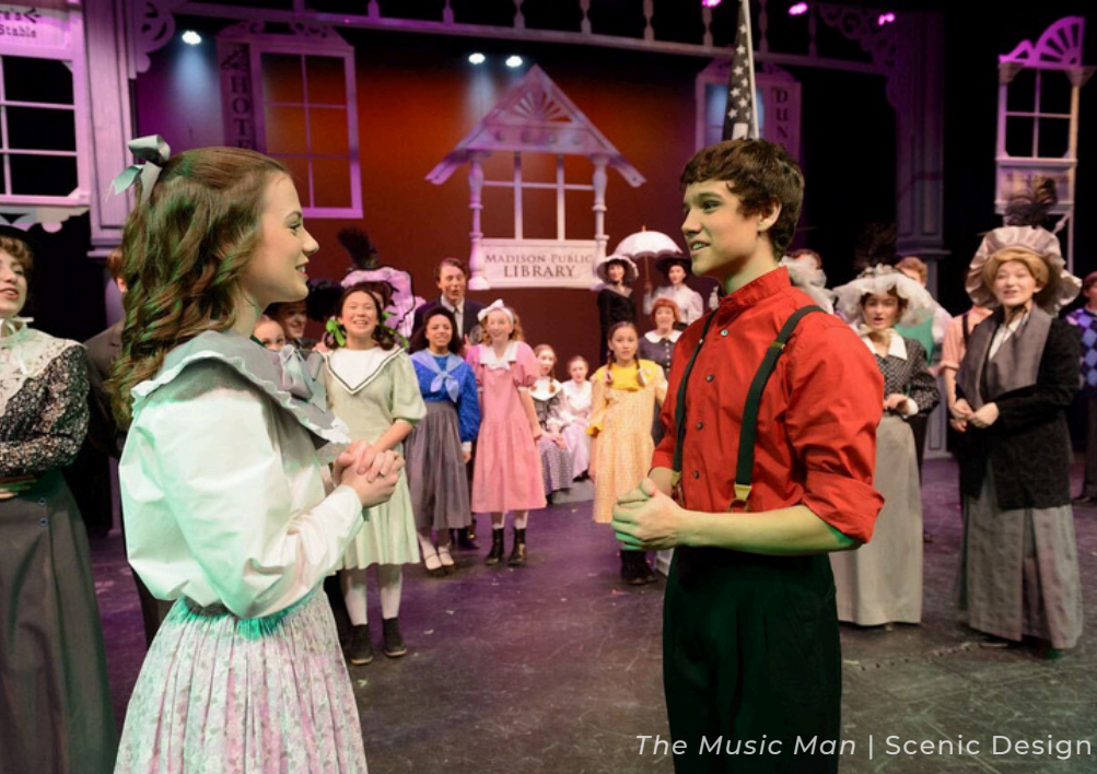
The Music Man | Scenic Design