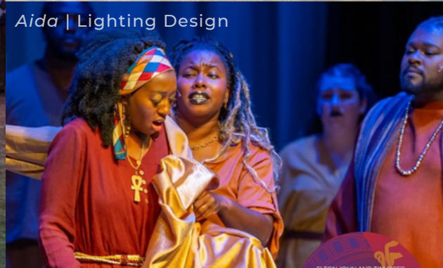
Aida | Lighting Design