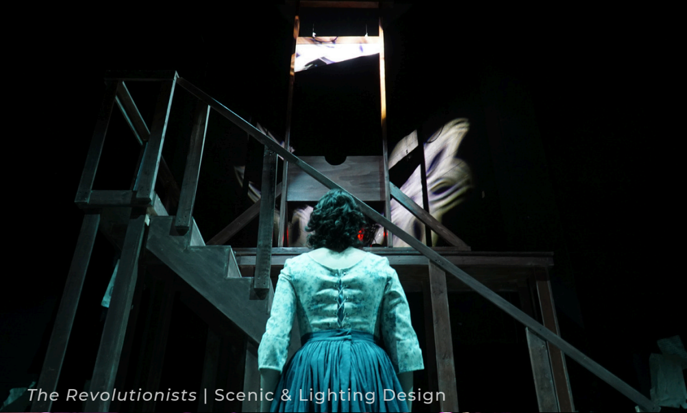
The Revolutionists | Scenic & Lighting Design