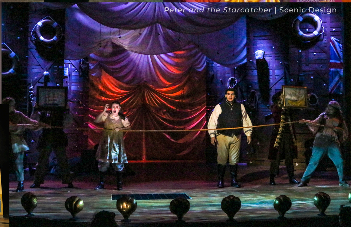
Peter and the Starcatcher | Scenic Design